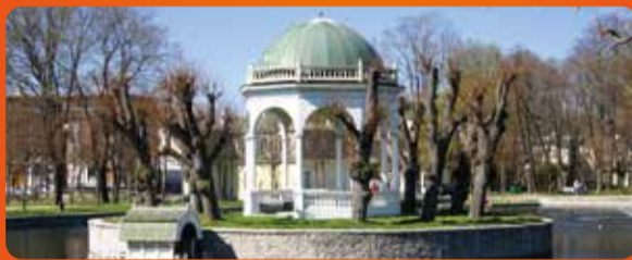
8. KADRIORG PALACE ENSEMBLE