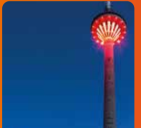
10. TV TOWER