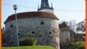
17. ESTONIAN MARITIME MUSEUM