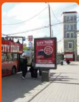
1. VIRU SQUARE