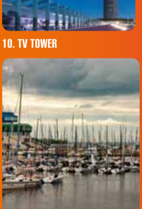
12. PIRITA YACHT HARBOUR