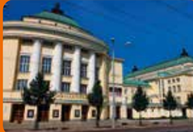
4. ESTONIAN NATIONAL OPERA