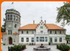
8. ESTONIAN HISTORY MUSEUM