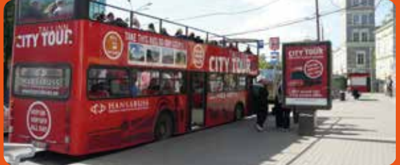
END - VIRU SQUARE