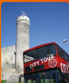
2. TOOMPEA CASTLE, OLD TOWN