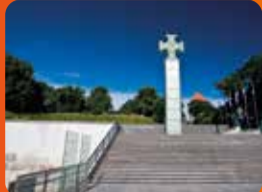
3. FREEDOM SQUARE