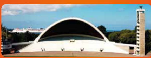
7. SONG FESTIVAL GROUND