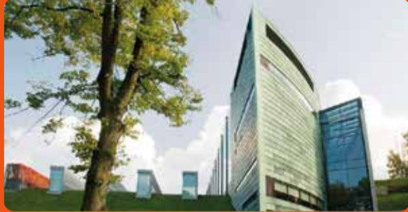
6. ART MUSEUM OF ESTONIA KUMU