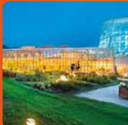
9. TALLINN BOTANIC GARDEN