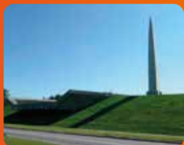
8. MAARJAMÄE WAR MEMORIAL